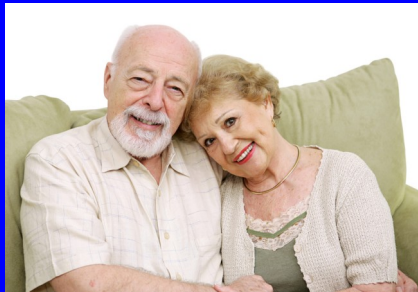
Life Beat keeps you comfortably at home, cared for by your family.

The best time to call Life Beat is before you need us. We can meet with you and your family and explain our services in full, all free of cost and commitment. If the time is not right for Life Beat, we will put you in touch with the services that are right for you. Then you can bring Life Beat in when you need us. Discuss your options with your doctor and feel free to call us with any questions. Heart disease is hard enough to manage — you don't have to do it alone. Let Life Beat help you.